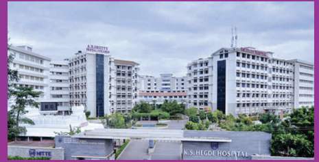
KS Hegde Medical Academy