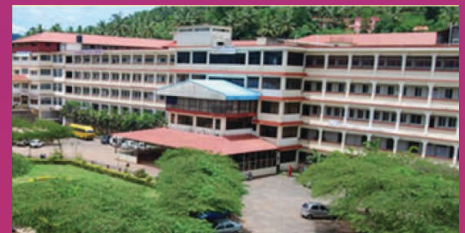
K.V.G. Medical College