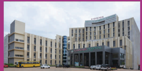
Kanachur Institute of Medical Sciences