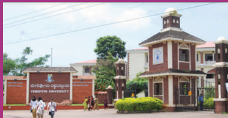
Yenepoya Medical College