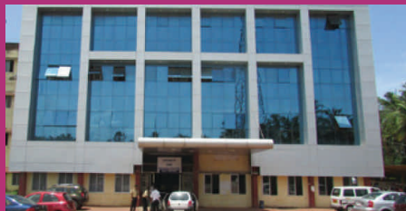
Srinivas Institute of Medical Sciences