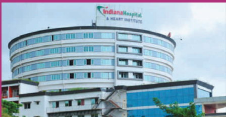
Indiana Hospital & Heart Institute