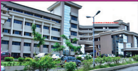
AJ Institute of Medical Sciences